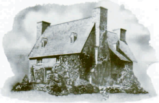
THE OLD STONE HOUSE