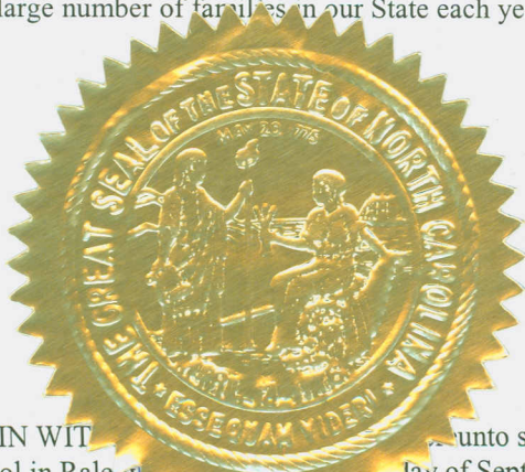
BEVERLY EAVES PERDUE

NOW, THEREFORE, I, BEVERLY EAVES PERDUE, Governor of the State of North Carolina, do hereby proclaim October 2010, as " DOMESTIC VIOLENCE AWARENESS MONTH " and October 1, 2010, as " DAY OF UNITY " in North Carolina. I further urge our citizens to increase their awareness and education of this destructive force which deeply affects a large number of families in our State each year and to become part of the efforts to stop violence in families.